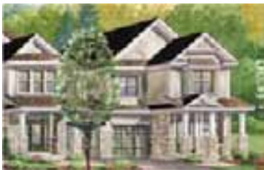
The Cardinal Corner (Elev. B)

The 2,260 sq. ft. Azalea semi-detached model sports an international eclectic theme. According to Patton, "Here, we mixed classic modern pieces with carefully selected antique accents to showcase a sophisticated, yet funky personal style. Winter whites, smoky taupes, onyx and pearl greys are the background for jewel tone accents."