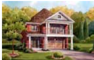
The Southwind (Elev. A)

Buyers can see for themselves by touring "model row" – two singles, one semi and one townhome, each of which Patton has given its own distinct style and personality, aimed at a wide variety of buyers.