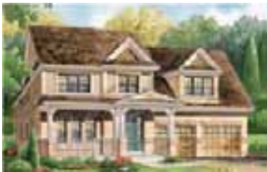
The Bronte (Elev. B)

The exterior of Heathwood's homes reflect Milton's old Ontario heritage while inside you will find open-concept spaces surrounding owners with luxurious features and finishes. And every home at Traditions is ENERGY STAR® qualified, which conserves energy, saves homeowners money, and helps the environment.