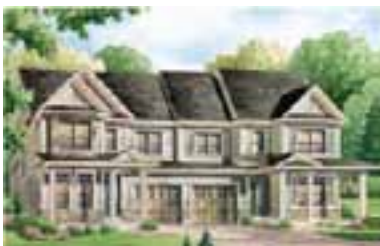
The Azalea (Elev. C)